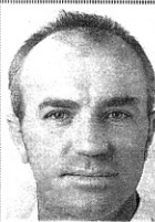
Greg without hair

MADAME DOUBTFIRE — THE NOVEL CONTINUES: PAGES 38,39